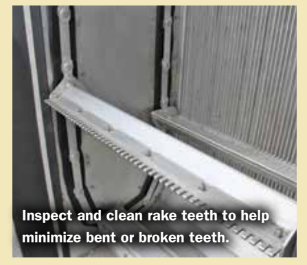
Bar screens (single bar and multiple rake)